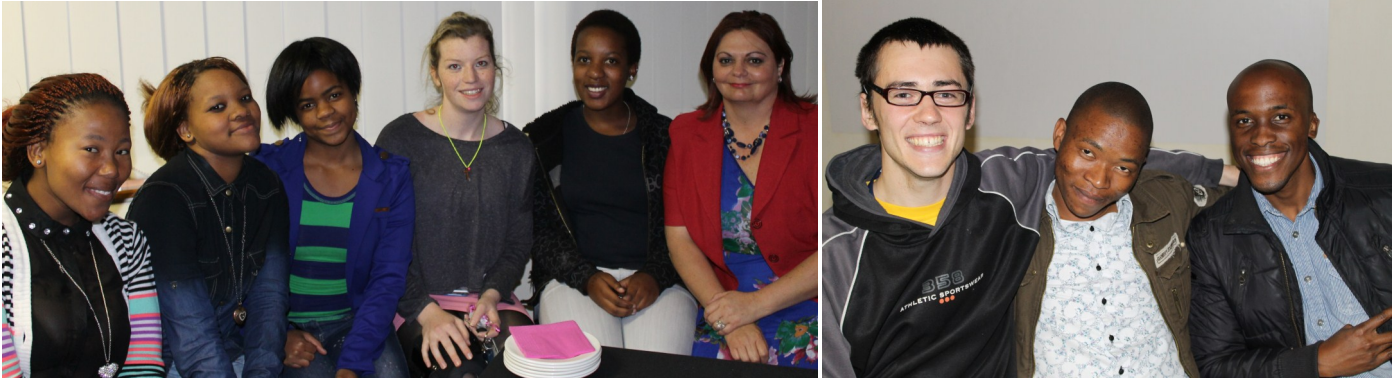
FIRST YEARS' LUNCH (Above): First-year nursing students enjoying their lunch with their mentors and fellow classmates

A partnership has existed between the Nursing Department and Student Academic Development (CTLM) since 2009, focusing on addressing the academic developmental needs of the first-year nursing students. Again this year, the 2013 first-year nursing students were mentored by third-year Social Development students.