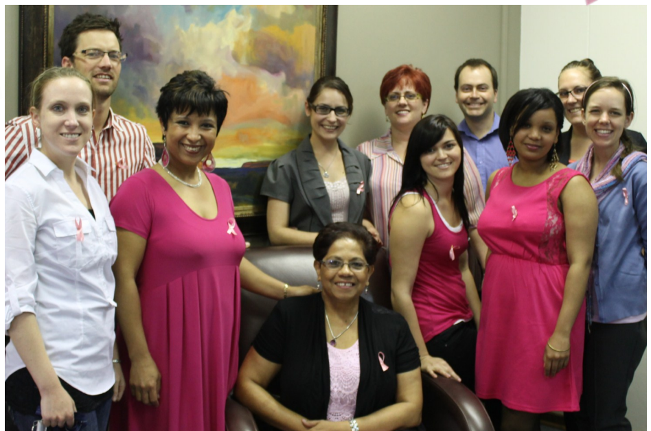
SUPPORTING BREAST CANCER: Nursing staff along with some staff members from the School of Clinical Care Sciences