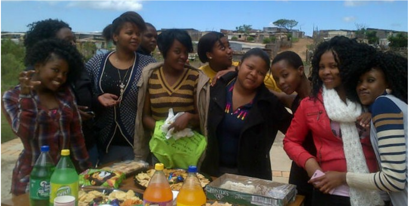
FIRST YEAR SOCIAL: First-year nursing students enjoying their social gathering with their fellow classmates

Education is power; with great power comes great responsibility: to work hard and play harder.