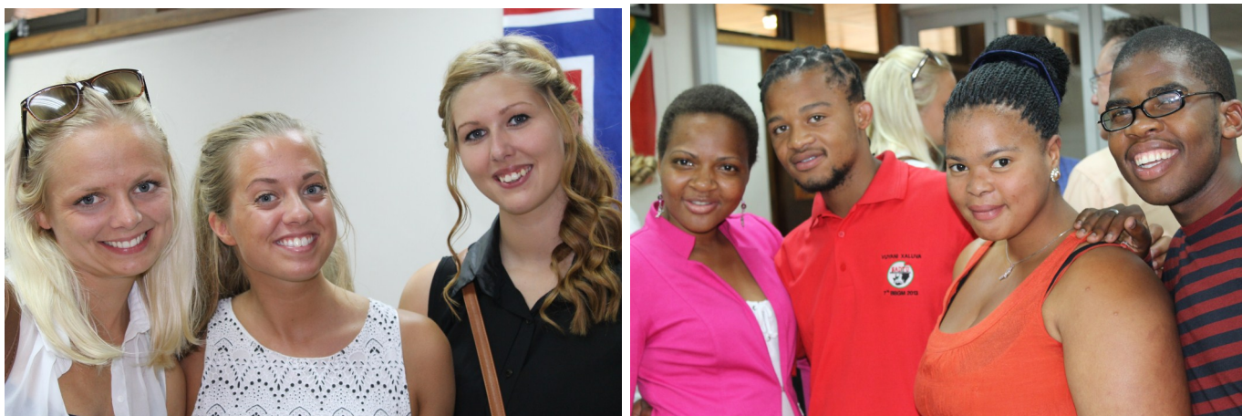
INTERNATIONAL SOCIAL: (from left) Norwegian students together with Student Representatives from Nursing Science