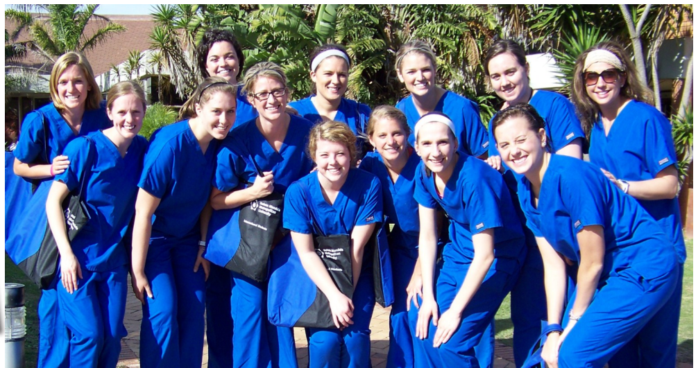
INTERNATIONAL VISITORS... St. John's University & St. Benedict's College students visiting NMMU Department of Nursing Science.